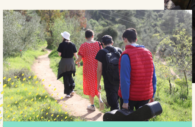
The Wild Walks project helps teens find their place in Israel

Every week we gather in fascinating locations around Israel to explore the country, have meaningful discussions, make arts, visit outstanding Israeli artists and venues.